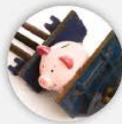
Fed Stress Test