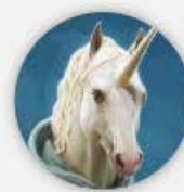
Tech Bubble 2.0