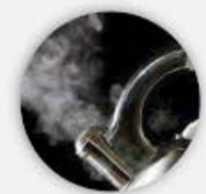
Rising Interest Rates

We have identified nearly 90 different scenarios, or we can build a scenario based on your forecast.